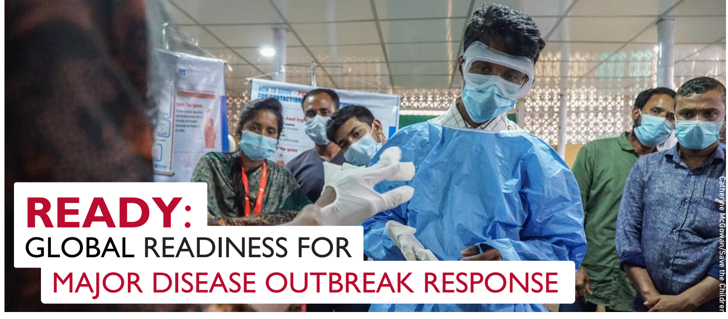
July 2020: Health care staff attend a training in a COVID-19 isolation and treatment center in Cox's Bazar, Bangladesh.

Large-scale infectious disease emergencies have disastrous impacts on families, societies, systems, and economies. For example, the impact of the 2014-2015 Ebola epidemic in West Africa stretched well beyond the estimated 11,310 deaths and the 28,616 known infections. Many health workers were lost and health systems were unable to cope—severely restricting access to routine and life-saving health services. Millions of children lost months of schooling—many never returned—and thousands of children lost parents, siblings, and family members. Disruptions to markets and livelihoods also had dire consequences for the poorest communities.